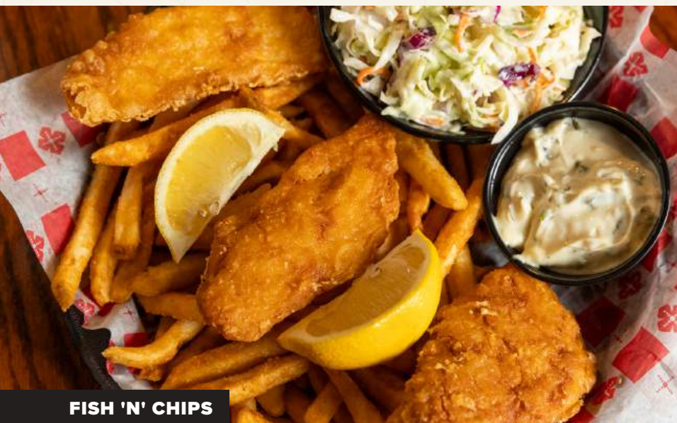
FISH 'N' CHIPS

Sliced tuna steak, lightly seared and served rare (unless requested otherwise) and drizzled with balsamic glaze. Served with seasoned rice and our vegetable of the day. 19.99