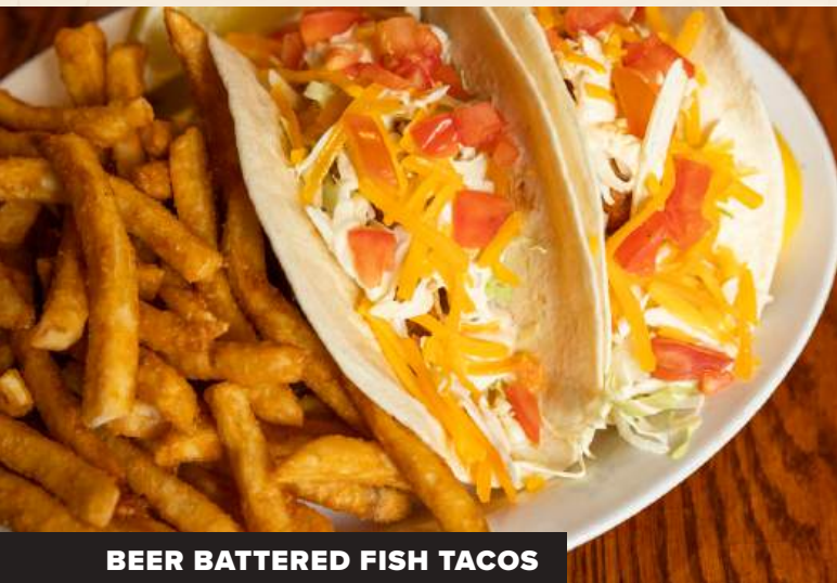
BEER BATTERED FISH TACOS