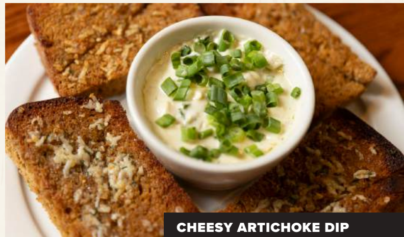
CHEESY ARTICHOKE DIP

House-breaded, deep-fried, bone-in wings tossed in fiery cayenne pepper sauce. 15.99 Add carrots and celery +3.50