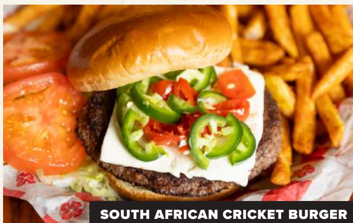
SOUTH AFRICAN CRICKET BURGER

A classic burger topped with sharp cheddar, bacon, BBQ sauce, and crispy fried onions. 18.99